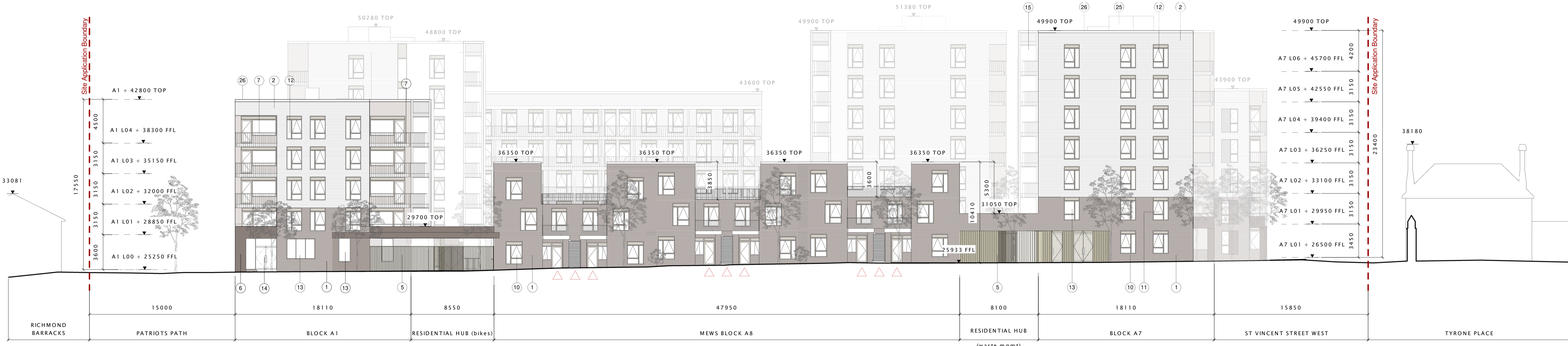
Main Residential Mews Street South Elevation